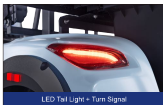
LED Tail Light + Turn Signal