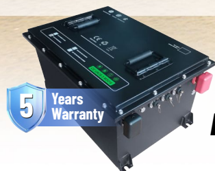
72V 105Ah Lithium Battery