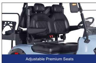
Adjustable Premium Seats