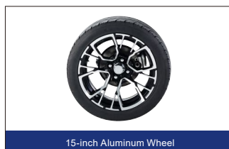
15-inch Aluminum Wheel