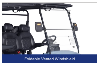
Foldable Vented Windshield