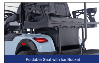
Foldable Seat with Ice Bucket