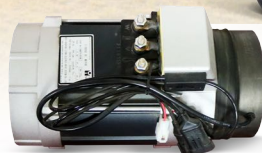
7500W Electric Motor