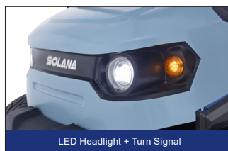
LED Headlight + Turn Signal