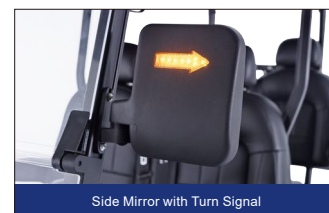
Side Mirror with Turn Signal